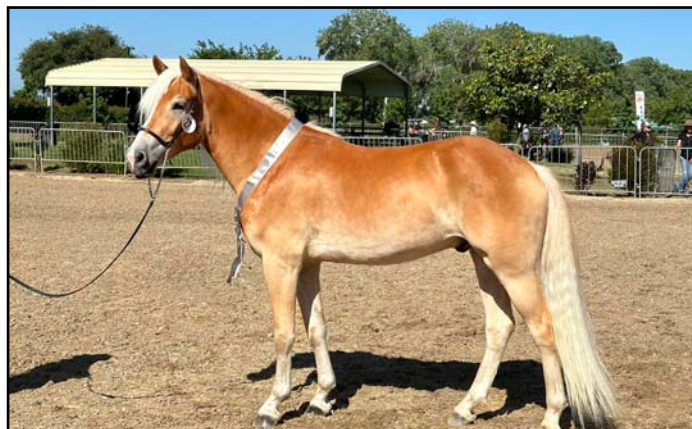
Nobelium FDL - Score 79