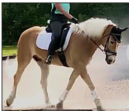
"I'm all business in the dressage arena!"