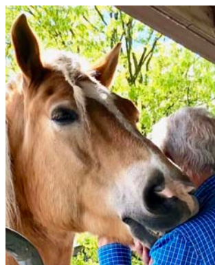
"And I love to give Papa a hug!"