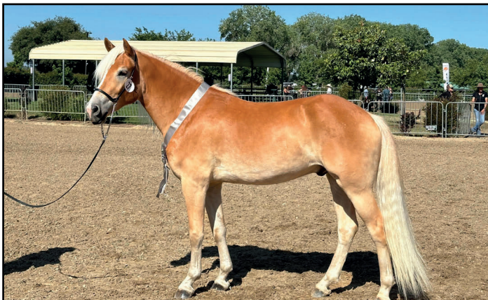
Nobelium FDL - Score 79

This year we had 19 Haflingers representing the breed. All the horses were gathered in a face to face barn so that the public could easily come and see our golden blondies. The daily demonstration was two parts, first the horses with carts, with 6 beautiful carts in attendance, then the horses being ridden and hand held for the public to enjoy. The public absolutely loves Haflingers and it was a great opportunity for people to come close and personal to the horses, ask questions, take pictures and pet the horses. Everyone was very well behaved and happy.